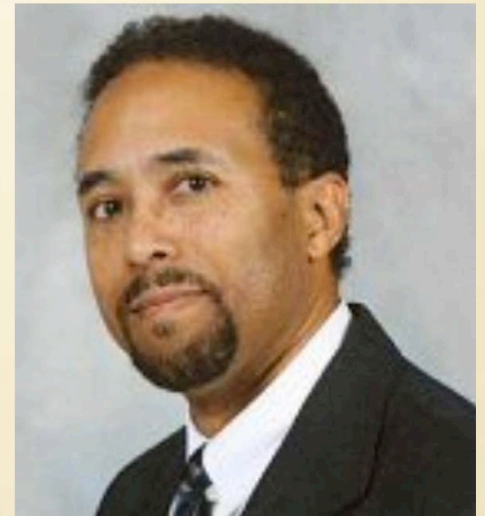
Director of Mission Networking